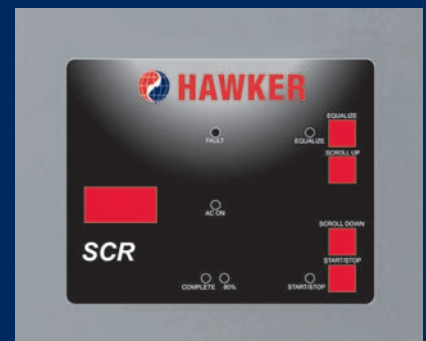
Below – Control panel is easy to read and operate.