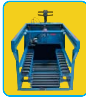
Two-Tier Roller Compartment