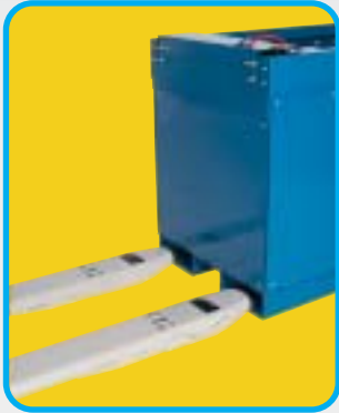
Fork Pocket Option (WTC-FP-C)