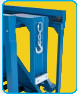
Standard Hook & Chain