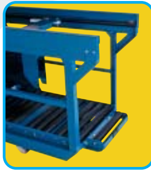
Extended Roller Compartment