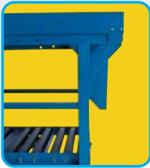
Extended Reach Cantilever